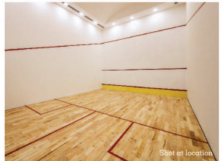
Shot at location