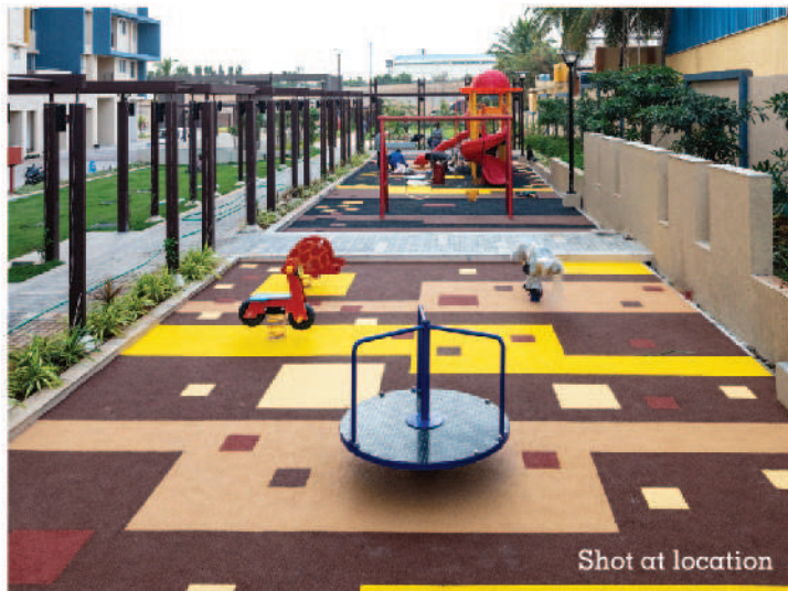
Shot at location