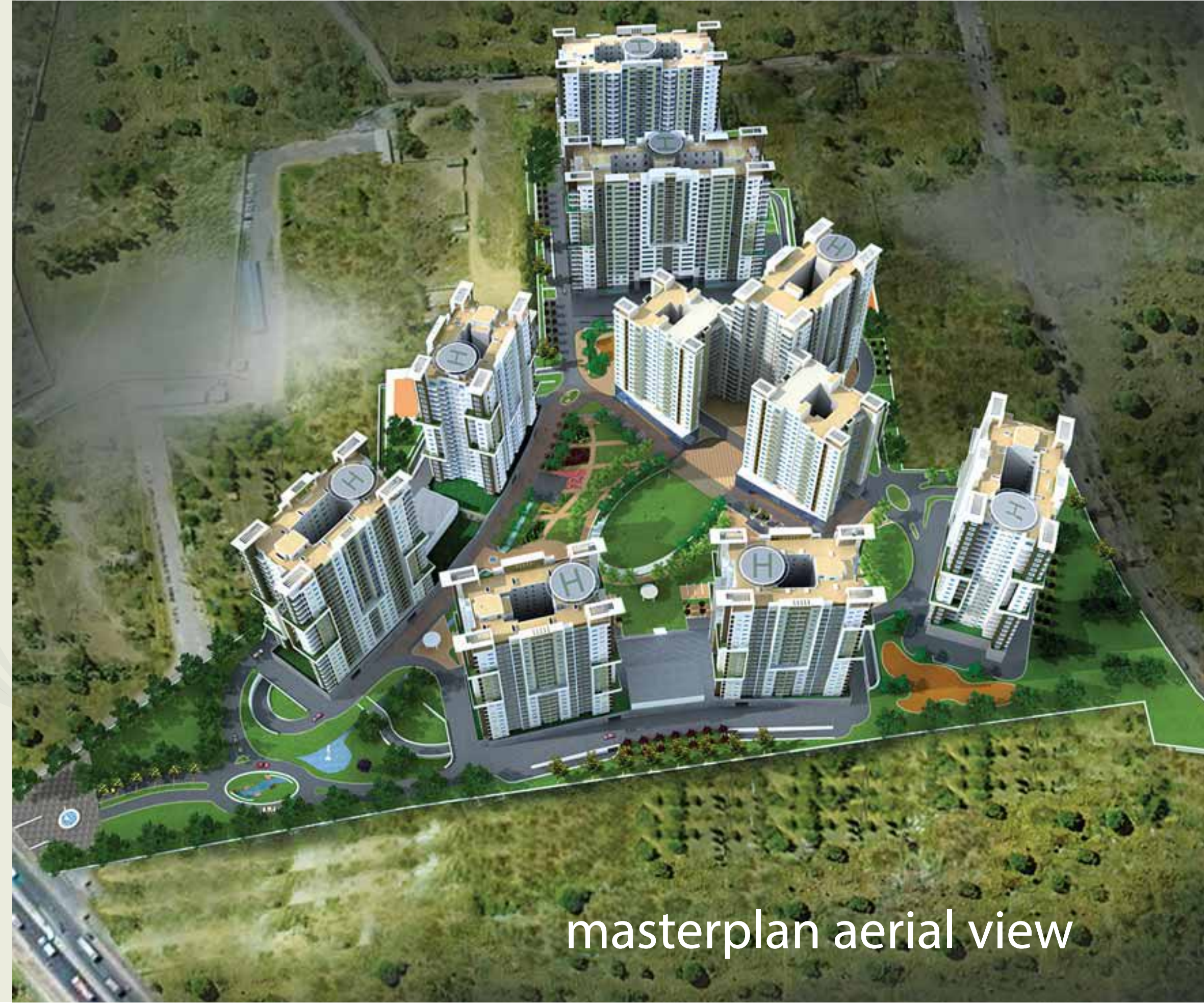
masterplan aerial view