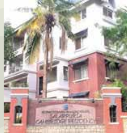
Salarpuria Cambridge Residency